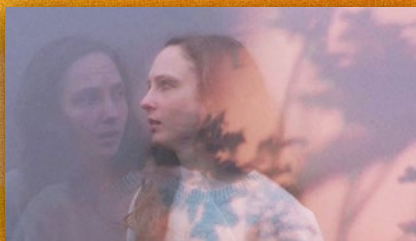
Tired Of Pretending Dir. by: Nikita Blauwart 07/22/2023