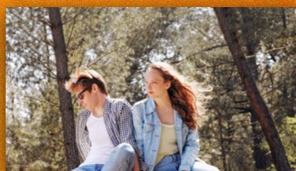
Hey! This Way Dir. by: Frenshyte Prod 03/02/2024